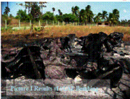
Picture 1 Results of SLAF Bombing